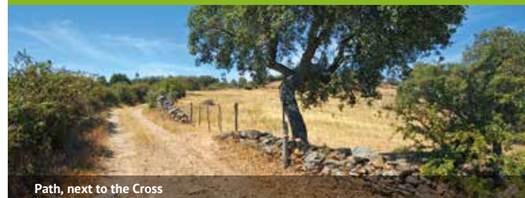
Path, next to the Cross