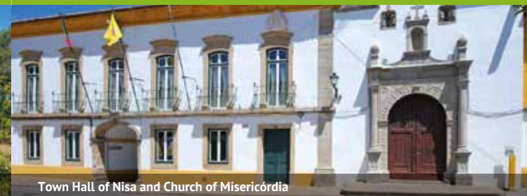
Town Hall of Nisa and Church of Misericórdia