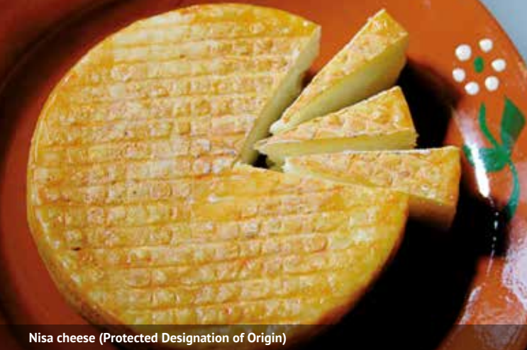
Nisa cheese (Protected Designation of Origin)