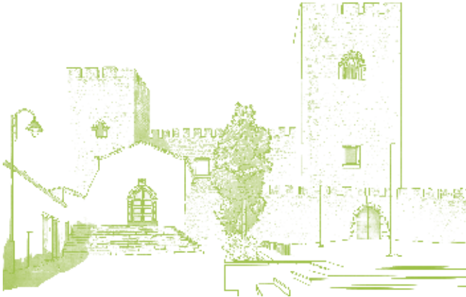
Castle of Amieira do Tejo. With square floor plan and equipped with four towers, the north corner tower was the Keep, which was also palace.

The walking path begins in Amieira do Tejo, one of the twelve villages of the Order of Malta. It starts on the square of the village council by the paved road and follows a pathway between walls, holm oaks and olive trees. After a short climb, the vegetation is formed by cistus, brooms, cork oaks and some vineyards.