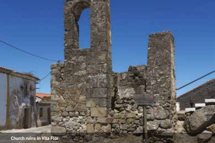
Church ruins in Vila Flor